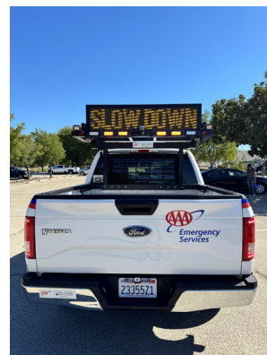
Examples of VMS signage on our service trucks with the SDMO message.